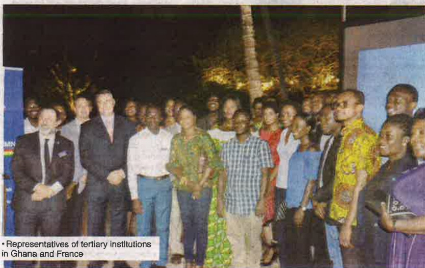
• Representatives of tertiary institutions in Ghana and France

She said the French educational system embraces people from different cultures with varying political, social and religious orientation.